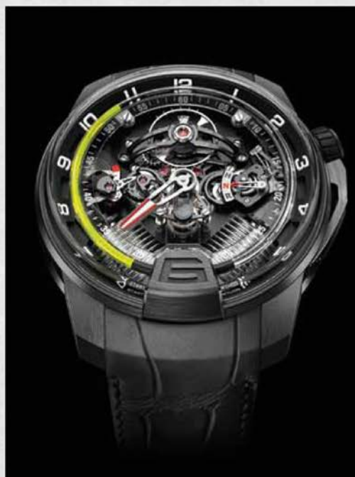
HYT H2 with its redesigned architecture

The ambitious array of the HI comprises eight case versions, including titanium, pink gold and one in titanium and bronze. The HI Red 2 uses a red fluorescent liquid to tell the time, rather than the highlighter-type hue used on the other styles.