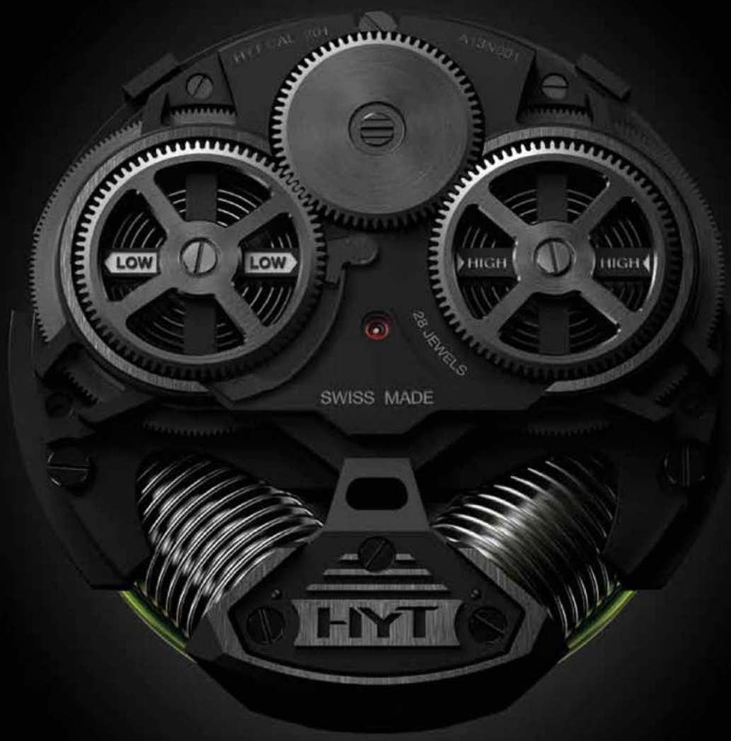
Two flexible reservoirs with a capillary attached at each end are the core of the HYT design.