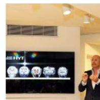
For more information, please visit the official HYT Watches website. Follow Haute Time on Instagram to catch all of the new releases as they happen.

All content and source © 2015 Haute Time | Hautetime.com is brought to you by Haute Media Group