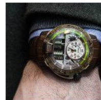
For more information, please visit the official HYT website. Follow Haute Time on Instagram to catch all of the new releases as they happen.