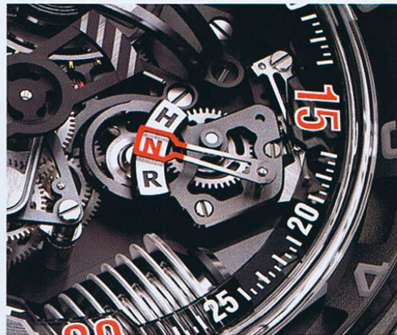
A big red minute hand over the left below; crown position indicator that depicts three positions: H, N and R