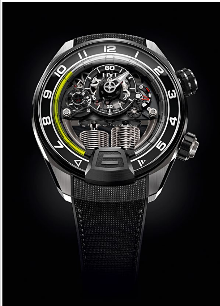
The watch offers grand illumination by night and superb architecture by day

The new H4 Metropolis has the same DNA as its predecessors, and is built on the same chassis as the inaugural H1 release, but with some enhancements. The H4 is meant to be a fully illuminated piece. To do that the watch has been equipped with two LED light sources located discretely at the 6 o'clock position. The push piece between the 4 and 5 o'clock positions activates a generator. The pressure winds the mechanism which in turn powers the two LED lights. The end result is a soft blue light that illuminates the watch. The green liquid used to tell time for the piece will also become iridescent from the LED lights. The charge last for approximately 5 seconds, after which the generator will need to be activated again. The entire process is mechanical, no batteries included or needed.