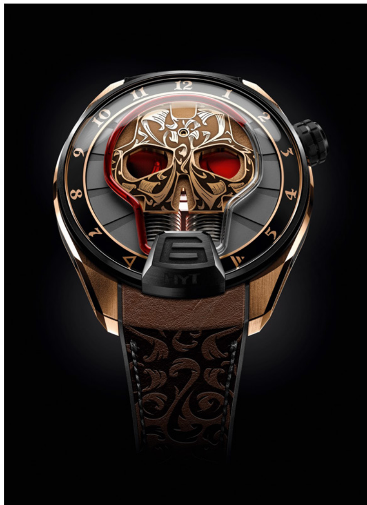
HYT's Skull Maori: now accompanying Axl Rose on tour throughout the world

But now Rose comes out with something horological that he has the opportunity to make all his own: a collaboration with boutique watch brand HYT, which is famous for its groundbreaking use of liquid as the time-telling display.